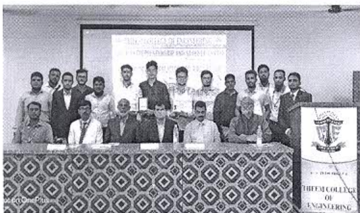
Group photograph of Theem's Start-up Leaders