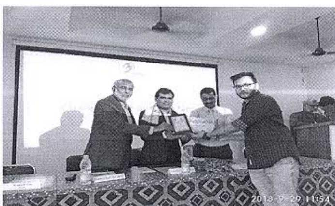
Felicitating Theem's Startup Leaders by Our Chief Guest and Delegates