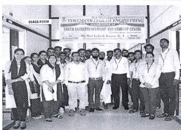
Degree and Diploma Students and Staff show interest on Entrepreneurship and Start-up