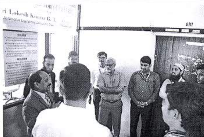
Delegates shares his experience in Entrepreneurship and Start-up