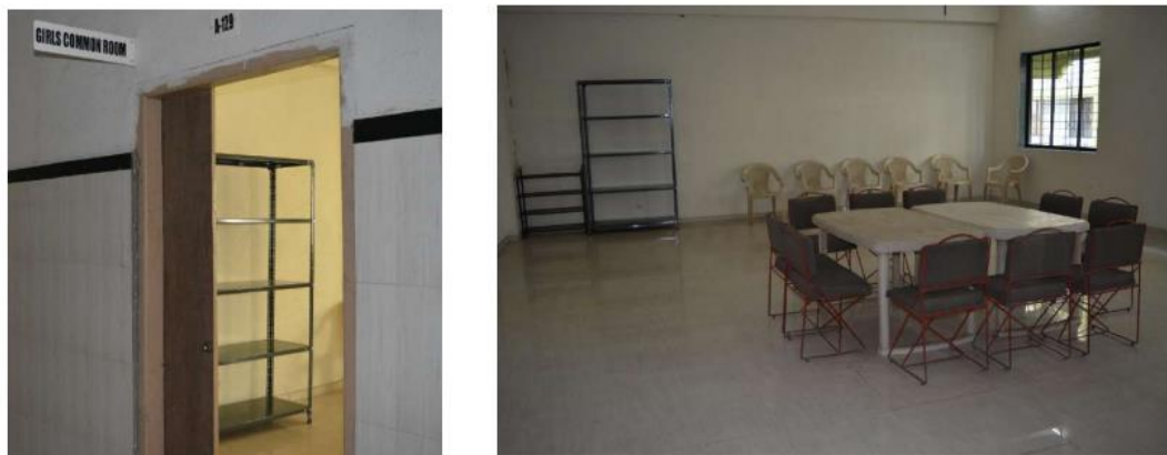
Girls Common Room.