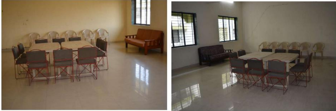
Boys Common Room.

3. Common Room The institute has separate common rooms for both boys and girls with an adequate facility that makes students comfortable while using it and they are free to give a suggestion. The management gives a proper response to the suggestions. For physically challenged students, special types of facilities are arranged as per their convenience. The facility of sanitary napkin vending machines are provided at ladies room.